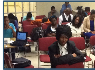
NEC School of Prayer