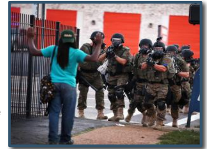
Remembering Ferguson Missouri

But the end of all things is at hand: be ye therefore sober, and watch unto prayer.